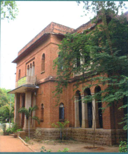
Daniel Poor Memorial Library